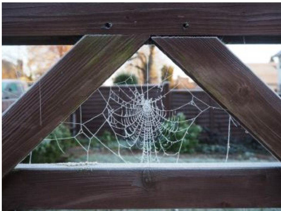
Spider's web, Hinton Way

Parish Council: Minutes, Plans and Criticisms