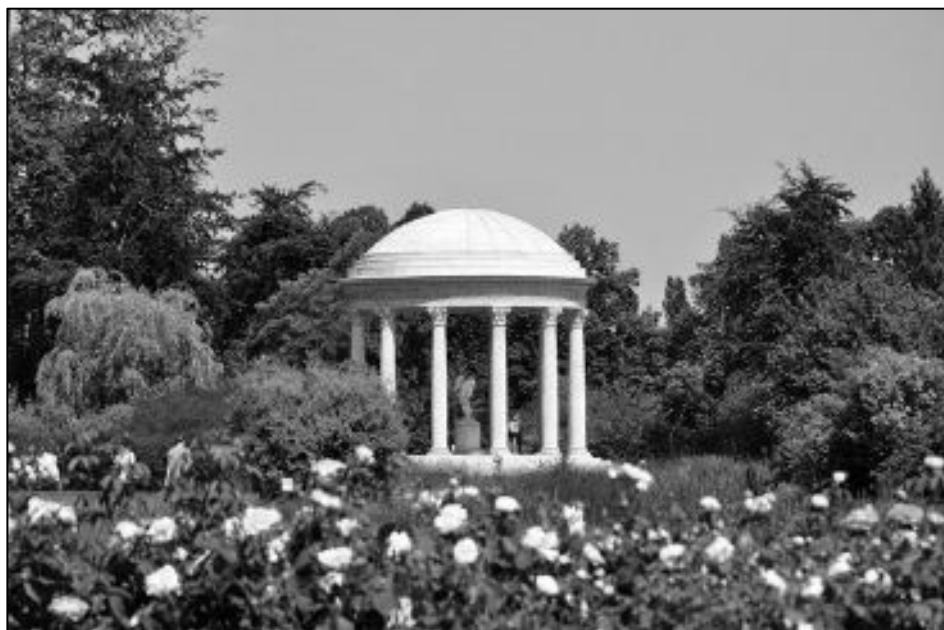
Marie Antoinette's garden at Versailles