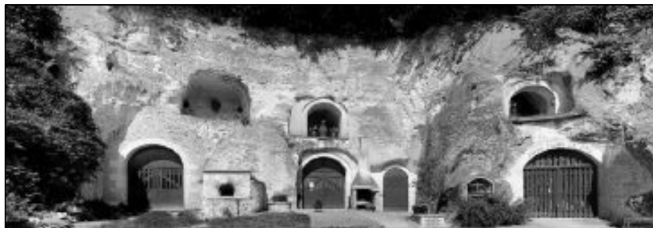
Caves Cathelineau, producer of Vouvray wines