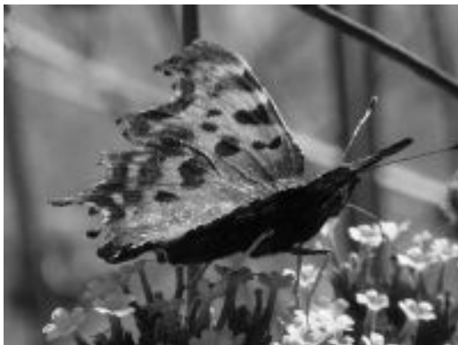
Comma butterfly on Verbena bonariensis .

So why is it so much better than others? The large flower spikes bear fresh flowers over many weeks giving longevity of flowering and hence nectar supply. The flower colour is attractive but not spectacular and is unlikely to be a significant factor in why ‘Sussex’ is the top destination. We suspect it simply produces more nectar than other cultivars and it is this that attracts so many insects.