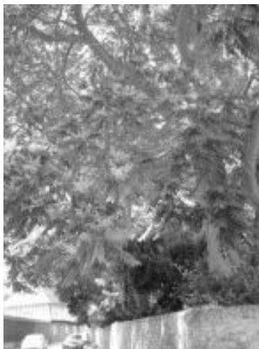
Tree of Heaven outside the Old Vicarage in Church Street

Now this one is intended to be a bit of fun – a mixture of village history and tree appreciation. Our village trees are an important part of the scenery, but their presence can't just be taken for granted. So we'll stop and look at a tree or two, and ask why is it there and what has it got to tell us? Not to mention all sorts of interesting insights into trees! Meet outside the church. Please note the earlier time, due to the nights' drawing in.